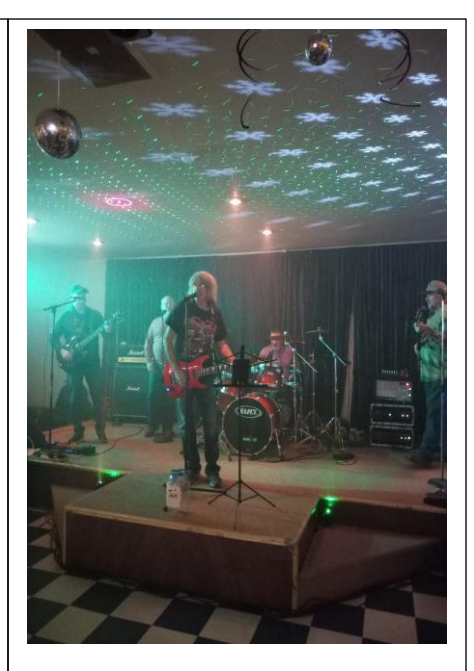
Plumb Crazy (the band) rocks in the New Year at the Legion party.